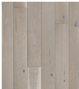
BF41 Silver Matt UV Lacquered