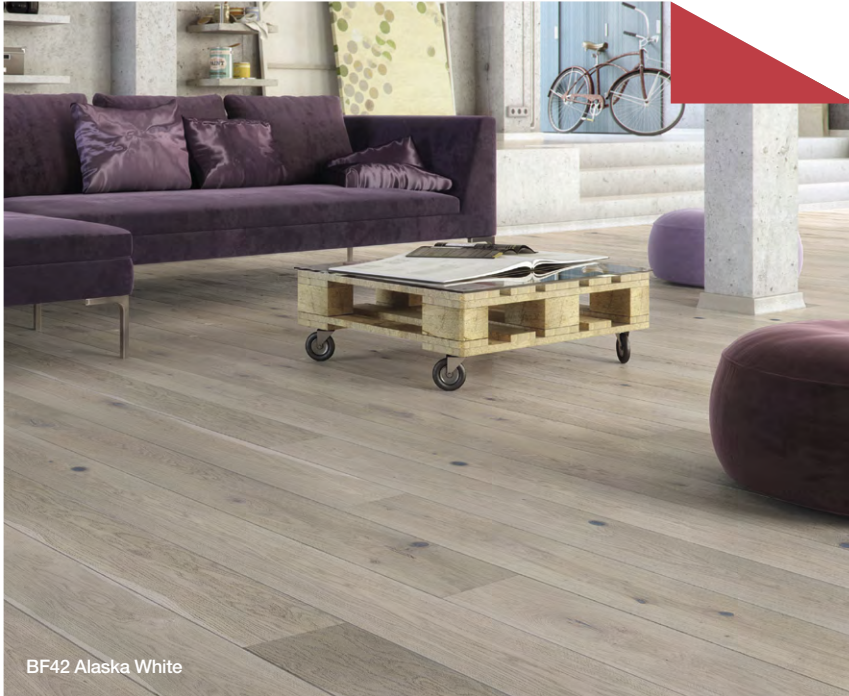
BF42 Alaska White