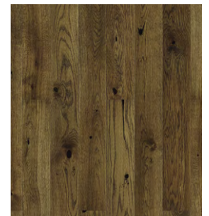
BF44 Milk Chocolate Matt UV Lacquered