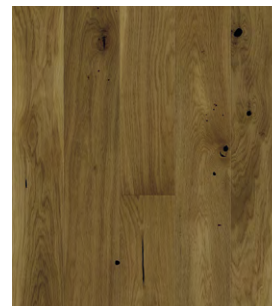
BF43 Butterscotch Matt UV Lacquered