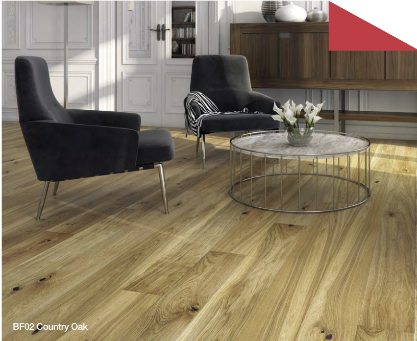
BF02 Country Oak