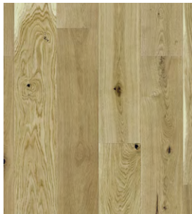
BF01 Oak Natural Matt Lacquered