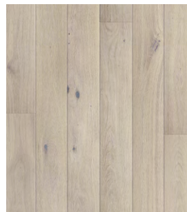
BF42 Alaska White Matt UV Lacquered