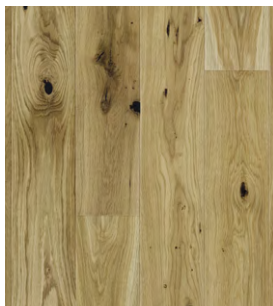
BF10 Natural Oak Matt UV Lacquered