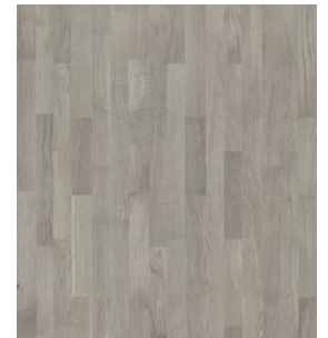
BF16 Grey Oak Washed 3 Strip Matt UV Lacquered*