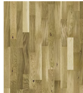
BF11 Oak 3 Strip Matt Lacquered