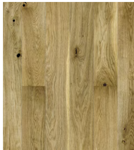
BF02 Country Oak Brushed & Oiled*