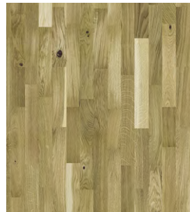
BF03 Rustic Oak 3 Strip UV Lacquered